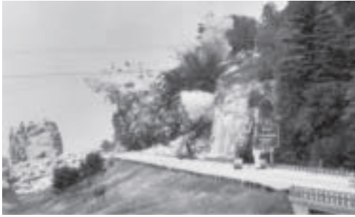
Blasts on Rte. 189, New London, NH, in the mid-1980s and on Rte. 193 outside of Boston, Massachusetts during the late 1980s.