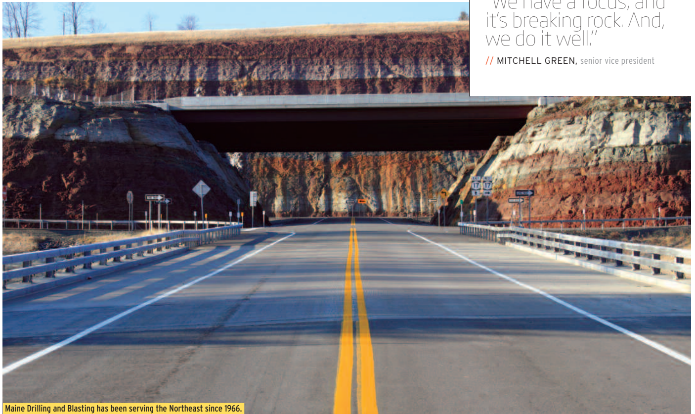
Maine Drilling and Blasting has been serving the Northeast since 1966.