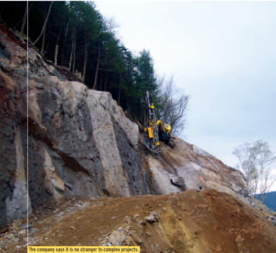
The company says it is no stranger to complex projects.