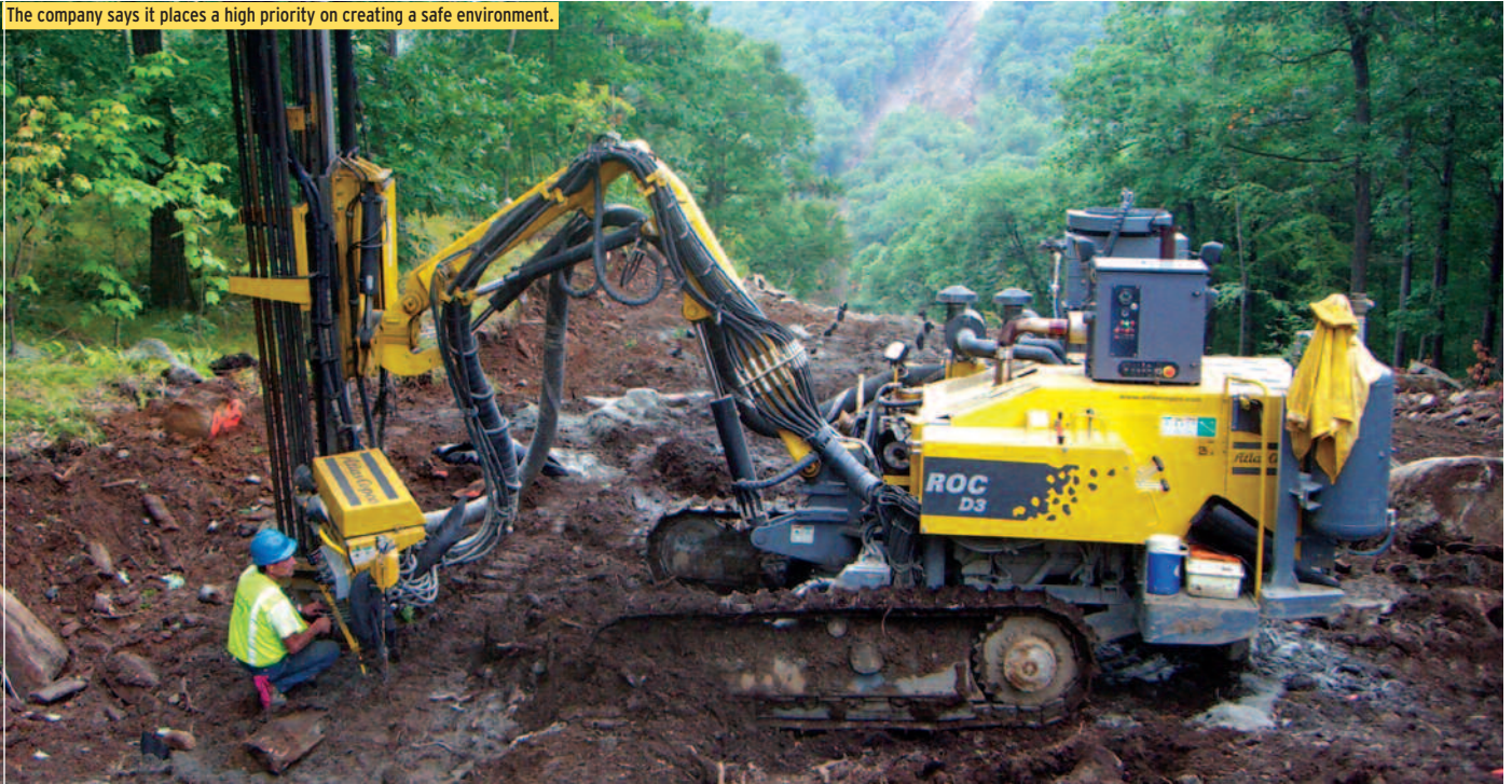
The company says it places a high priority on creating a safe environment.

ing technical services, and equipment repair capabilities all come together seamlessly on every project, regardless of its simplicity or complexity.